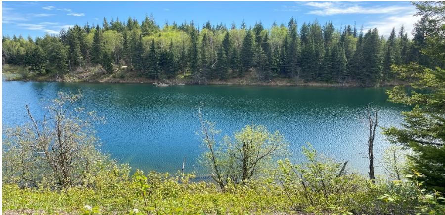
Eskers Provincial Park